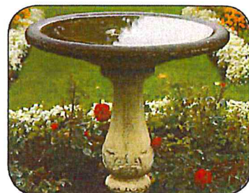
Weekly, empty standing water from fountains and bird baths.