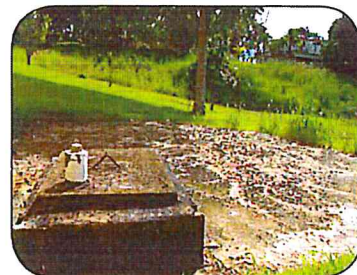
Keep septic tanks sealed.