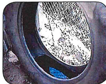
Recycle used tires or keep them protected from rain.