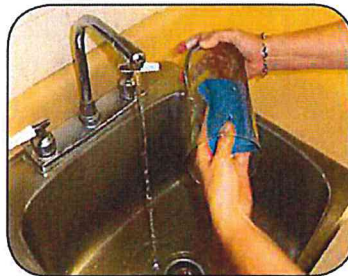
Weekly, scrub vases & containers to remove mosquito eggs.