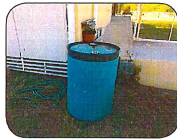
Keep rain barrels covered tightly.