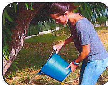
Drain & dump any standing water.