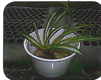
Put plants in soil, not in water.