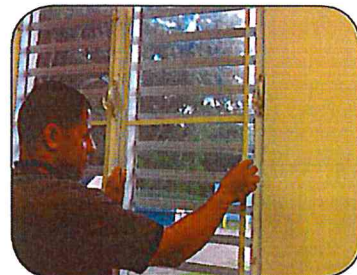
Install or repair window & door screens.

For more information, visit: www.cdc.gov/dengue , www.cdc.gov/chikungunya , www.cdc.gov/zika