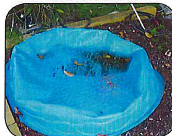
Drain water from pools when not in use.